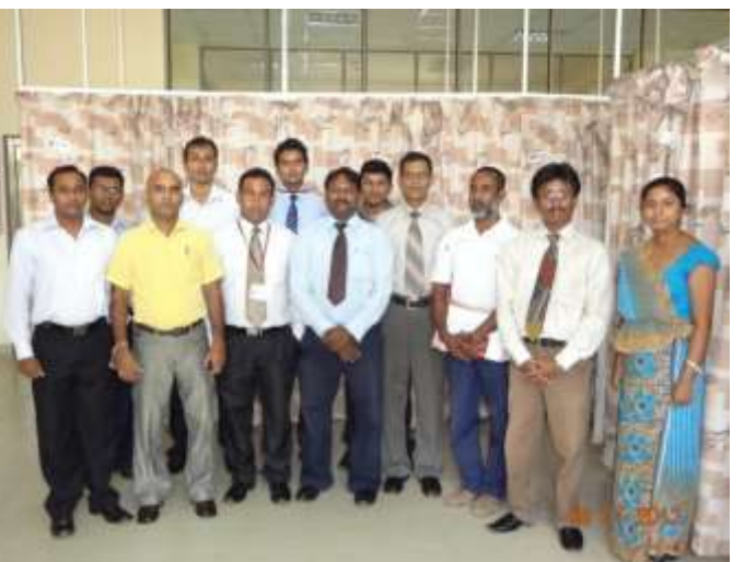
Assessment and awareness camp at Professorial Unit, Anuradhapura General Hospital on 1st June 2012