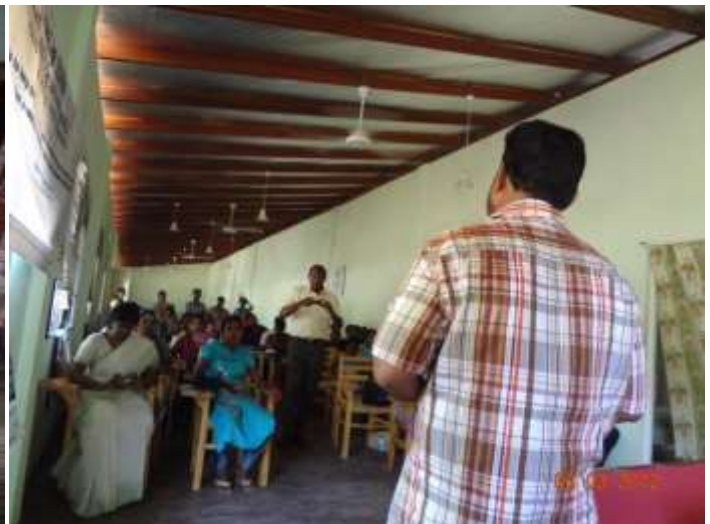
Assessment and awareness camp at on Karuna Nilayam, Killinochchi 3rd June 2012