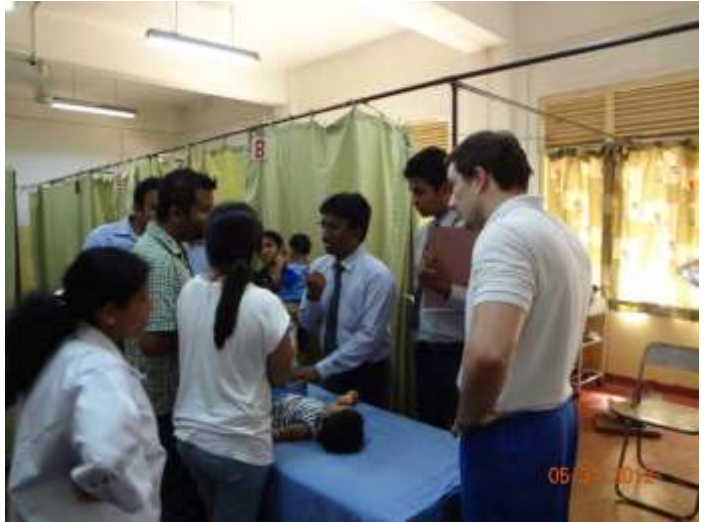
Assessment and awareness camp at Physiotherapy Department, Kandy General Hospital on 31st May 2012