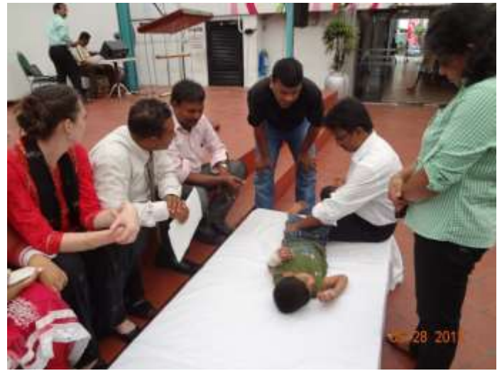
Assessment and awareness camp at Excel World, Colombo on 28 th May 2012