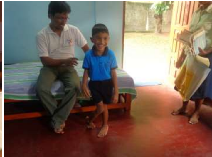
Assessment and awareness camp at Wattala, 2 nd September 2013