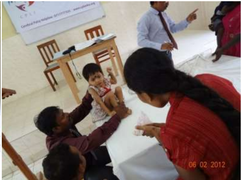
Assessment and awareness camp at Nursing School Hall, Jaffna on 2nd June 2012