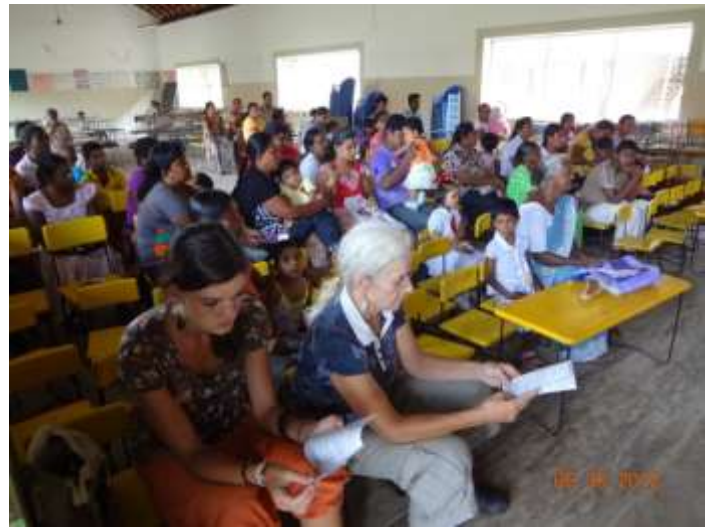
Assessment and awareness camp at Martin Wickramsinghe College, Habaraduwa, Galle on 30 th May