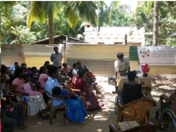
Assessment and awareness camp at Killinochchi on y 31 st August 2013