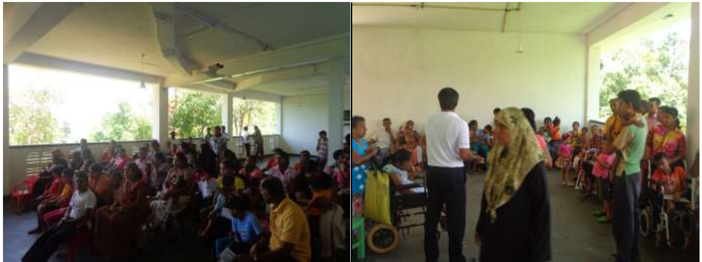
Assessment and awareness camp at Kandy on 30 th August 2013

30 th August- 2 nd September 2013- Awareness and assessment camps were organized and conducted by CPLF for the second time with the help of Recoup, Bangalore, India . The programs were conducted in three districts (Kandy, Killinochchi, Colombo- 2 camps at Moratuwa and Wattala) Killinochchi) and nearly 100 children with their parents participated and benefitted.